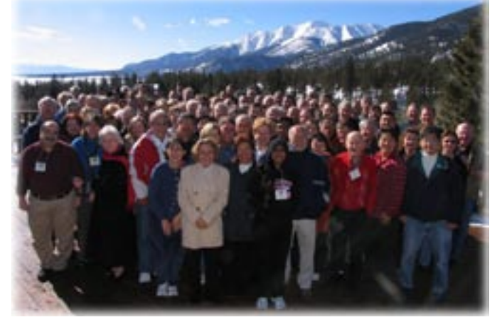
Leaders from around OC's world gathered in Colorado.