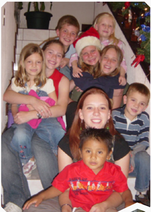
Our team kids are close like cousins!