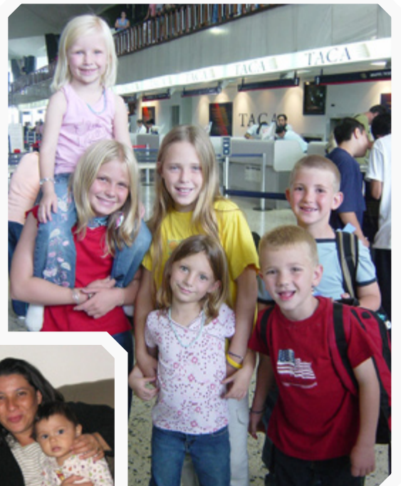
Friends as close as family!