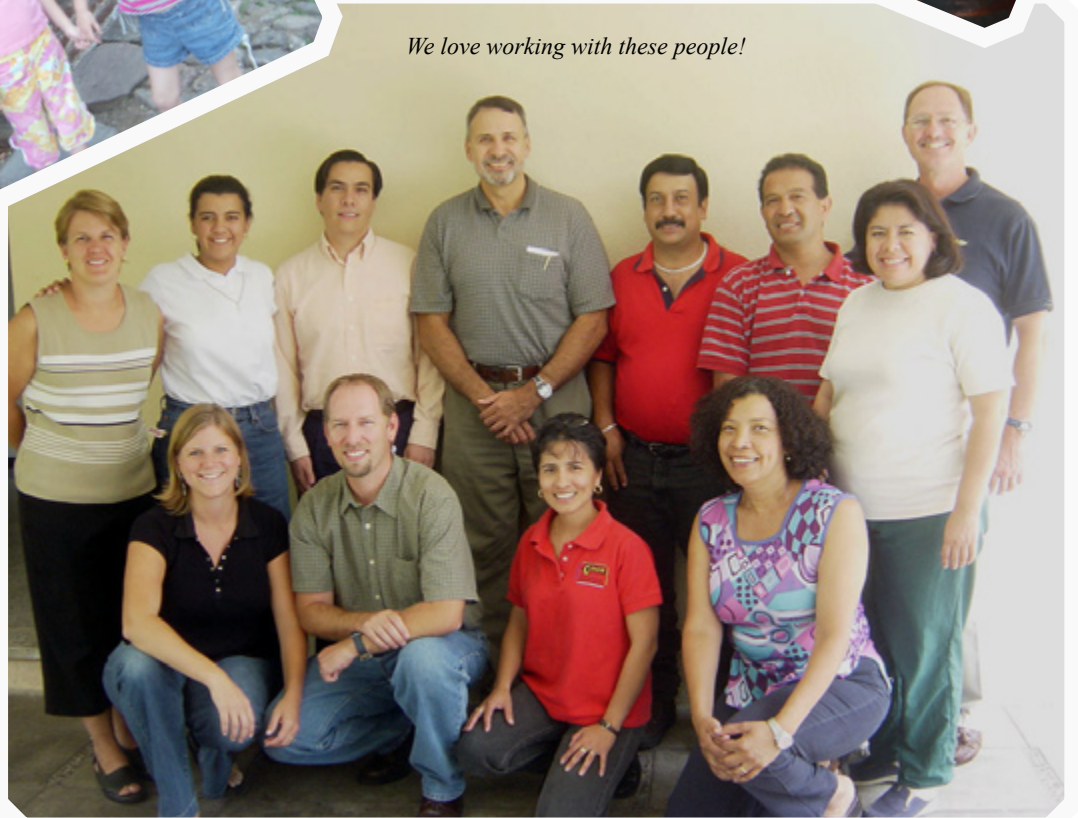
We love working with these people!