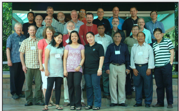
OC mission leaders meeting in Manila.