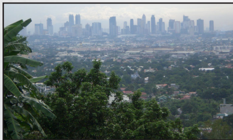
Manila skyline taken from Faith Academy.