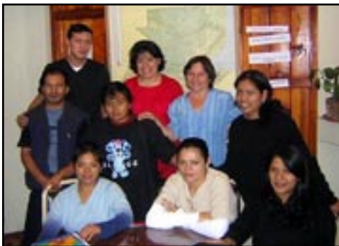
Project Mies 2003 participants.